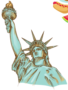
Statue of Liberty